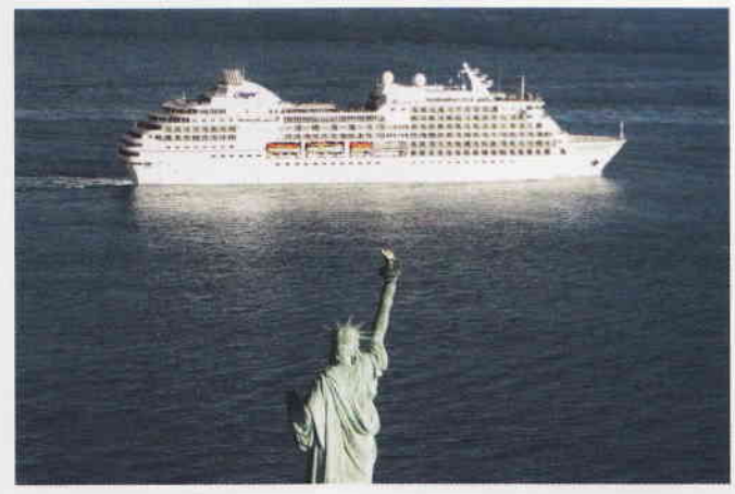
The World Voyage

Stepping aboard the 490-passenger Seven Seas Navigator in Vancouver, you wouldn't suspect the luxurious all-suite ship was once a Soviet research vessel. Safe and comfortable aboard Navigator, you'll head north to Alaska, spending six days immersed in its pristine beauty before sailing the length of Canada, Oregon and California to Mexico. Pressing on to Costa Rica, you'll transit the Panama Canal to Columbia and the Cayman Islands before skirting the southeastern US coastline, calling at Florida and South Carolina before arriving in New York. Regent Seven Seas Cruises (02380 682 280; rssc.com) offers the 33-night 'Vancouver to New York City' voyage from £9,319pp, including all shore excursions and international flights.