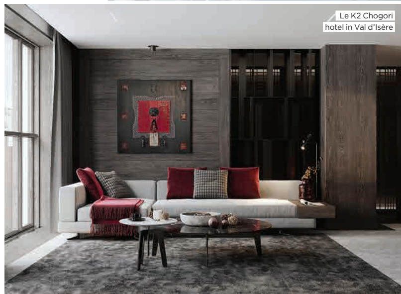
Le K2 Chogori hotel in Val d'Isère