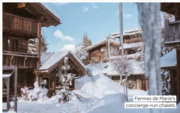
Fermes de Marie's concierge-run chalets