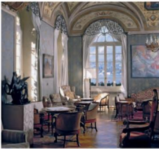
From top: An artist's impression of how Il Sereno will look; the Villa Pliniana; Grand Hotel Villa Serbelloni