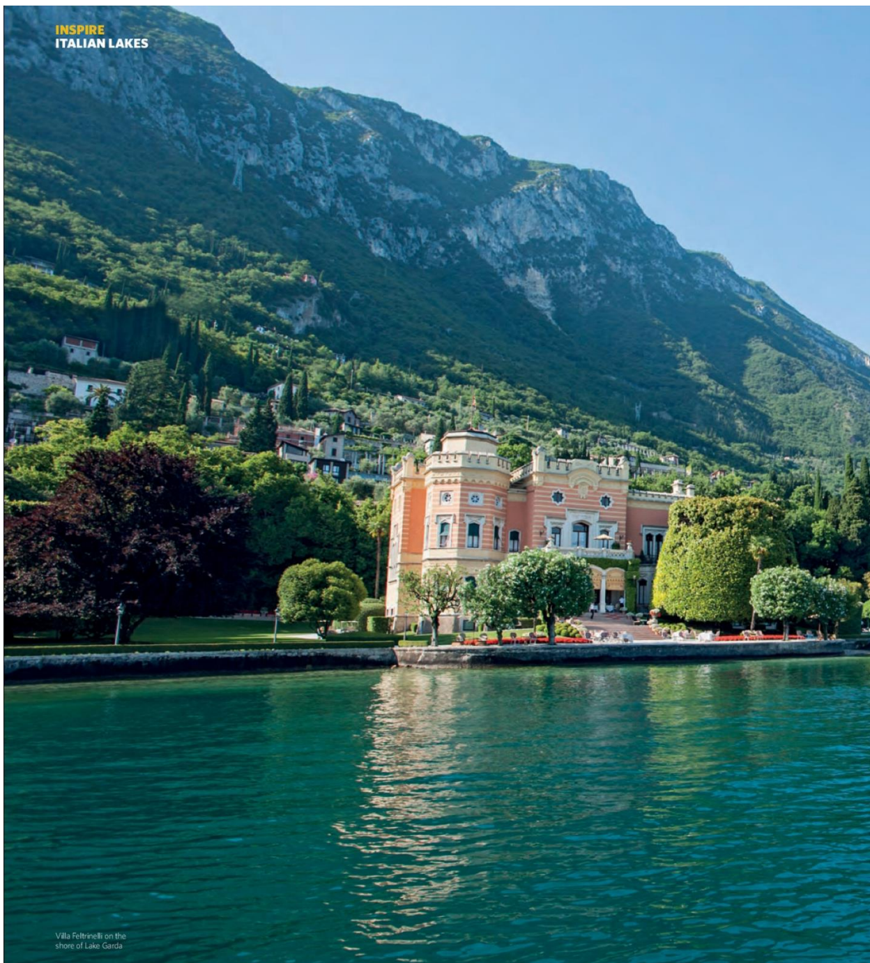
Villa Feltrinelli on the shore of Lake Garda