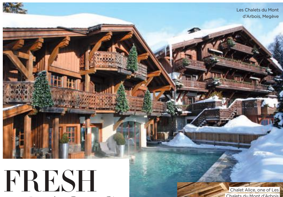
Les Chalets du Mont d'Arbois, Megève