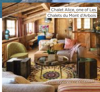
Chalet Alice, one of Les Chalets du Mont d'Arbois

Stateside, there is a new W Hotel in Aspen, its first ski property in North America, risen like a phoenix from the ashes of the famed Sky Hotel: bigger, better and taller than before, with rooftop bar, dance floor and pool overlooking