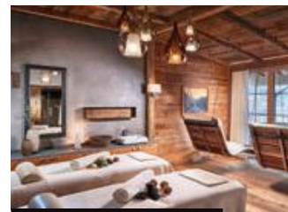
JAGDHOF, STUBAI VALLEY

Now an Alpine institution, the Folie launched its latest outpost last winter. Book an outside table at the adjoining La Fruitière for lunch, then join the après, Avoriaz-style. lafoliedouce.com