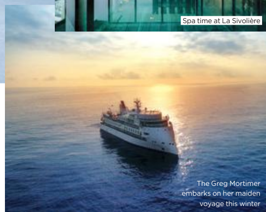
The Greg Mortimer embarks on her maiden voyage this winter

polar exploration specialist Quark Expeditions is offering heli-skiing with a side of polar cruising on the soon-to-launch, 199-guest, Ultramarine ( quarkexpeditions.com ).