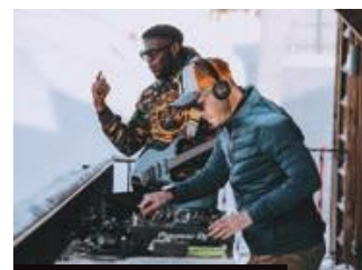
LA FOLIE DOUCE, AVORIAZ

Quite possibly the best mountain restaurant in the Alps. With stunning Matterhorn views from its triple-tiered terraces, lunch here is an Alpine rite of passage. chezvrony.ch