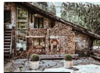
CHEZ VRONY, ZERMATT

Quite possibly the best mountain restaurant in the Alps. With stunning Matterhorn views from its triple-tiered terraces, lunch here is an Alpine rite of passage. chezvrony.ch