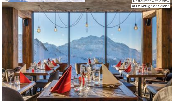
Restaurant with a view at Le Refuge de Solaise