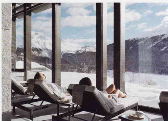
CLOCKWISE FROM TOP: ICELANDIC SKIING IS ON THE UP; LE GRAND JOUX, NEAR MORZINE IN FRANCE; RESTING UP AT KULM SPA IN ST MORITZ

Whether you're looking to tone those thighs, treat the children, indulge the husband or splash out on the holiday of a lifetime, the mountains are calling. And, while they won't come to you, there are ski specialists out there who'll make booking a holiday feel about as effortless as exactly that eventuality.