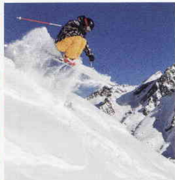
CLOCKWISE FROM TOP LEFT: ISCHGL IN AUSTRIA; THE DAS CENTRAL HOTEL IN SÖLDEN, AUSTRIA; ROOM AT L'APOGÉE, COURCHEVEL; THE POOL AT W VERBIER; DOWNHILL AT ISCHGL

The compact, traditional farming community of Ischgl might date back to the 10th century but today's largely car-free ski town combines the old-school luxury of resorts like Kitzbühel and St Moritz with a modern party scene to match (if not out-do) St Anton and Verbier. Ischgl's winters kick off and end with legendary on-mountain concerts given by big names like Robbie Williams, Kylie and Rihanna and continue through the season with lively après-ski and table-top dancing at Ischgl icons Niki's Stadl, Romantik Hütte and Pacha (yes, Pacha of Ibiza fame). ischgl.com ; 01483 345 723; ingham.co.uk