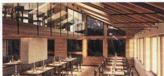
CLOCKWISE FROM TOP RIGHT: MONT TREMBLANT, IN MÉRIBEL; KULM HOTEL, IN ST MORITZ; NIRA MONTANA IN LA THUILE, ITALY; OUTDOOR HOT TUB AT CHALET PELERIN IN LE MIROIR, FRANCE