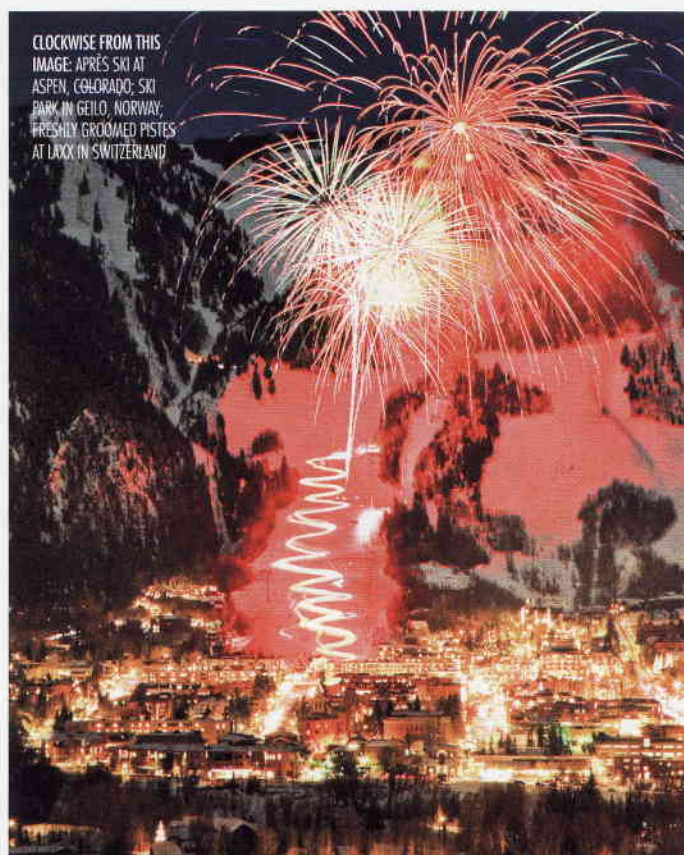
CLOCKWISE FROM THIS IMAGE: APRES SKI AT ASPEN, COLORADO; SKI PARK IN GEILO, NORWAY; FRESHLY GROOMED PISTES AT LAAX IN SWITZERLAND

There's something about a grand hotel like the St Regis in Aspen that captivates children like little else. The sparkling chandeliers, roaring fires, dapper bellboys