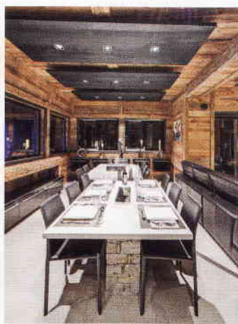
CLOCKWISE FROM ABOVE: CHALET MONT BLANC IN MEGÈVE; CERVO MOUNTAIN BOUTIQUE RESORT IN ZERMATT; CHALET QUEZAC IN TIGNES

Are we getting older or is Gstaad getting cooler? Regardless, we're particularly enamoured by two of the Swiss classic's freshly revamped hotels: Le Grand Bellevue and Saanevald Lodge. The former is a grand old hotel on Gstaad Promenade whose new young owners (who met and got married at the hotel before buying it) have injected it with eclectic style, a Michelin-starred restaurant, lively bar and heavenly spa. The latter is a quirky mountain lodge, which channels its 1960s heritage with vintage furnishings and a secluded wood-burning hot tub in the forest. camelsnow.com ; 020 8123 2859; slh.com ; gstaad.ch